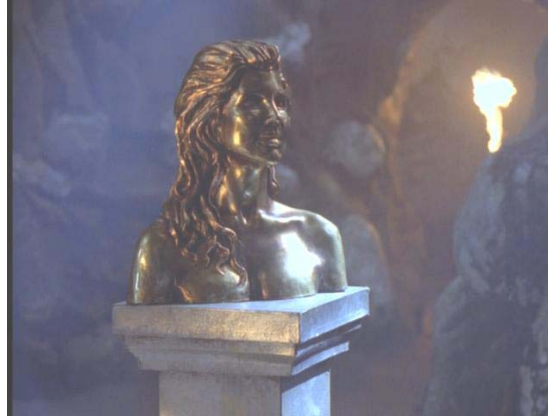
Aphrodite bust seen here in Hercules "Love Takes a Holiday" H 3 E 3

I don't remember my first breath, but there was earth still clinging to my body when I pulled my way out of the ground. Standing in Hephaestus' workshop, nude, I was able to speak, making sounds, but had no language until a young man, who seemed to glide through the air rather than walk, waved a serpent-decorated staff in my direction. I suddenly understood the conversation filling the air and I became curious about all of these proceedings. He was Hermes, Zeus' messenger, carrying his caduceus.