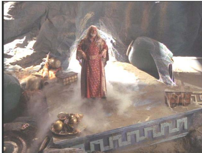
Zeus seen in "God Fearing Child" X 5 E

In Hesiod's misogynistic view, woman is at best a dependent creature unable to contribute to society, and at worst plagues man with her unhappy nature, and may be seen as a commentary on contemporary Greek social notions of the roles of men and women.