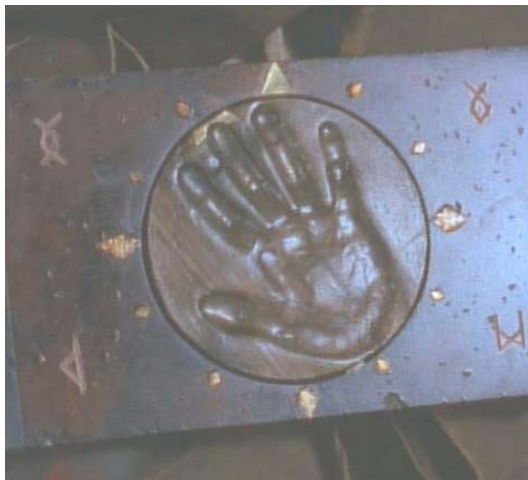
Pandora's box seen in X 1 E 4 'Cradle of Hope'