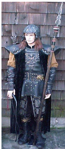
Tarkon in "Let the Games Begin" H 2 E 16